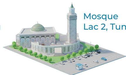
Mosque Lac 2, Tunis