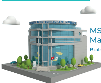
MSB Main Building Building ( A )